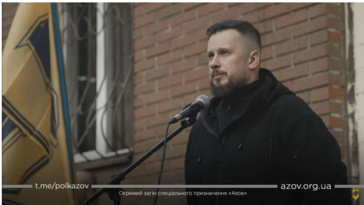
Azov Battalion founder Andriy Biletsky honoring the “heroes of Azov” on October 26, 2022

In fact, on October 26, 2022 – a mere two weeks before the ADL asserted a “split” between the Azov Battalion and the “political goals” of its founder – Biletsky delivered a speech at a ceremony in Kiev celebrating the renaming of a street after Azov in commemoration of their fight in Mariupol this April.